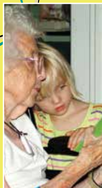
Personal and Social Responsibility