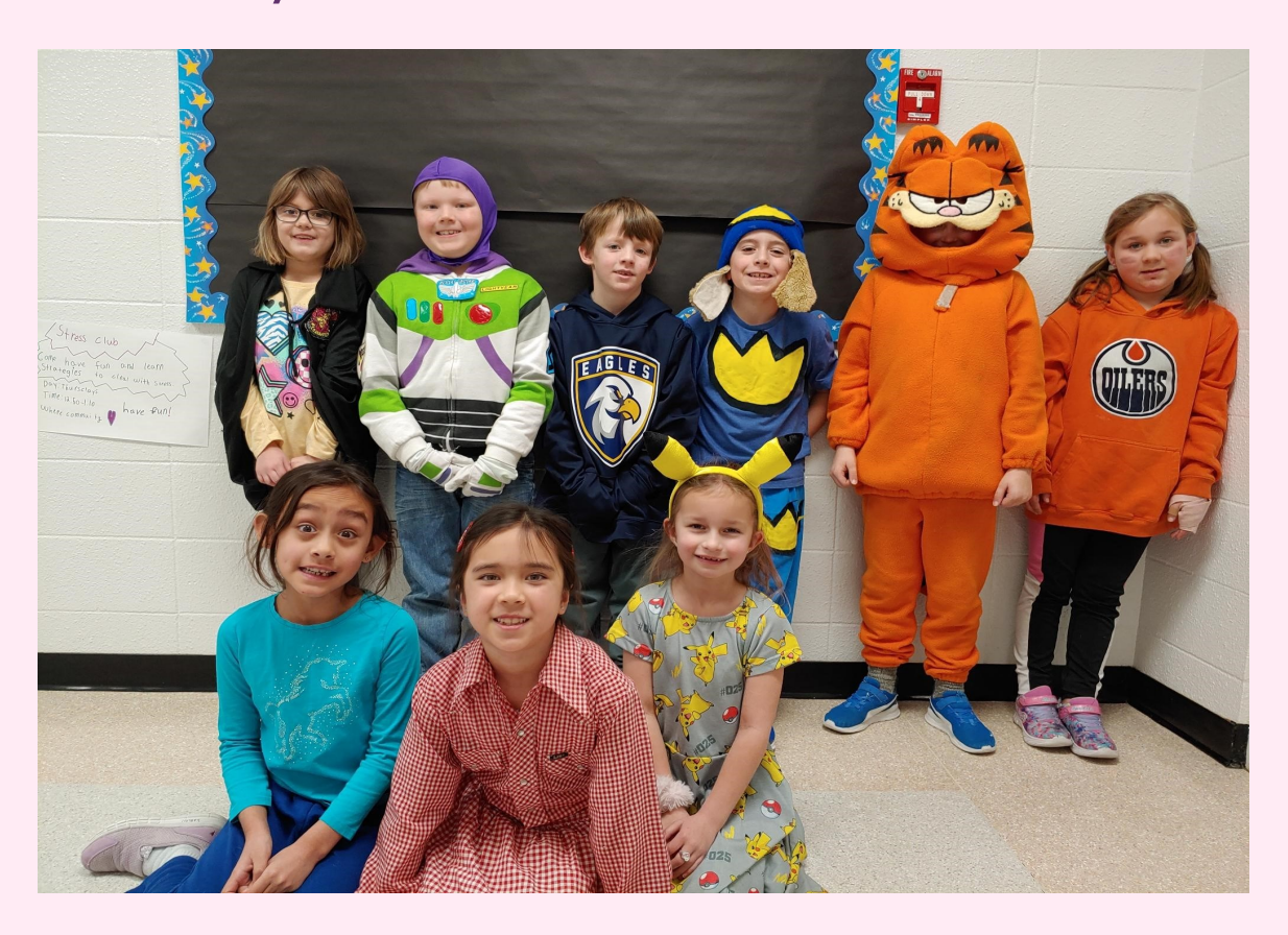
Dress Like your Teacher!